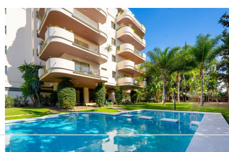
fo didiliqestates.com Local 28, Edificio D, Centro de Negocios Puerta