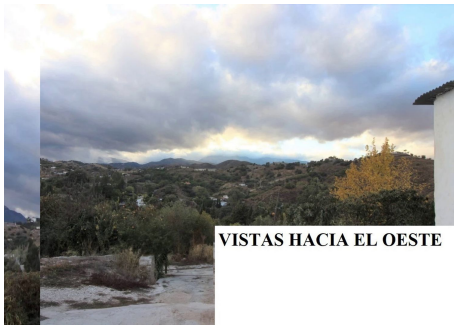
VISTAS HACIA EL OESTE