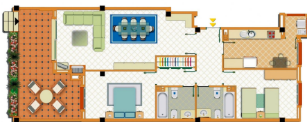
BAJO DE 2 HABITACIONES