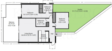
NOT TO SCALE Ground floor