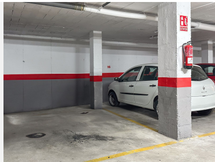
10/10 SCALE ground floor