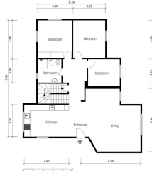
Med reservation for avvikelser.