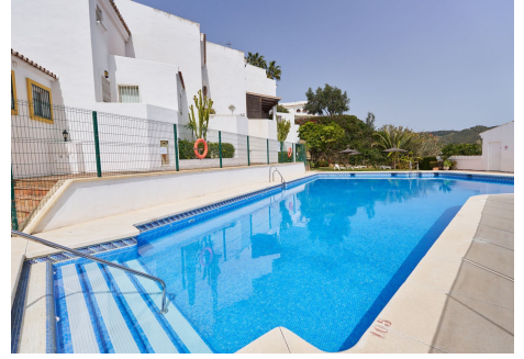
CASA ADOSADA LA RESERVA DE MARBELLA - MARBELLA (MÁLAGA)