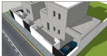
Rio Ural, 5. Altos del Rodeo. Marbella. Parking Space Design Proposal