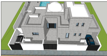
Rio Ural, 5. Altos del Rodeo. Marbella. Parking Space Design Proposal