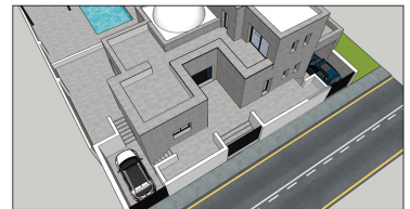
Rio Ural, 5. Altos del Rodeo. Marbella. Parking Space Design Proposal