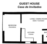
GUEST HOUSE Casa de Invitados

This is a representation of the layout of the property and it is not to scale. Este es una representación de la distribución de la propiedad y no está a escala.