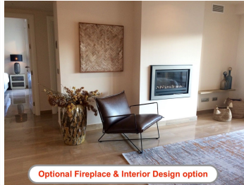
Optional Fireplace & Interior Design option