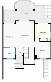
For Illustrative Purpose Only.