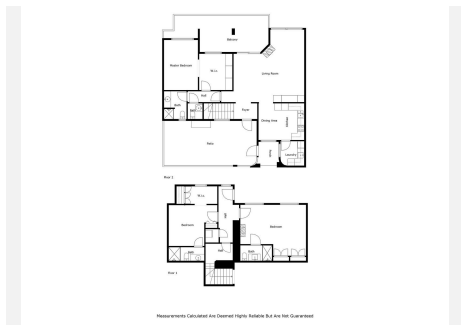
Measurements Calculated And Overlaid Rights Reserved. But Are Not Guaranteed